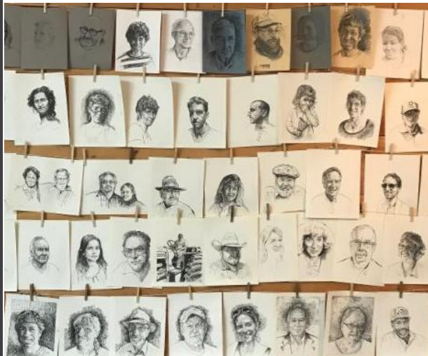
Left: Steven Skollar's collage of pencil and ink portraits

COME AND SEE IF YOU NEIGHBOR IS ON THE WALL, OR IF YOU RECOGNIZE YOUR FAVORITE LOCAL SPOT!