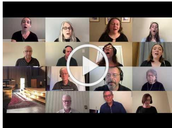
Flight Song • Performed by the Syracuse Vocal Ensemble

Join us for a Sunday afternoon of family fun full of choral music set to texts for children such as Goodnight Moon , Mother Goose , Aesop's Fables , and other traditional poems. Intended for children AND their parents.