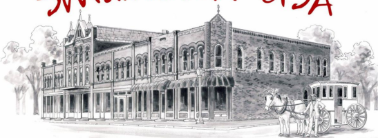
Earlville, New York First Settlement 1792